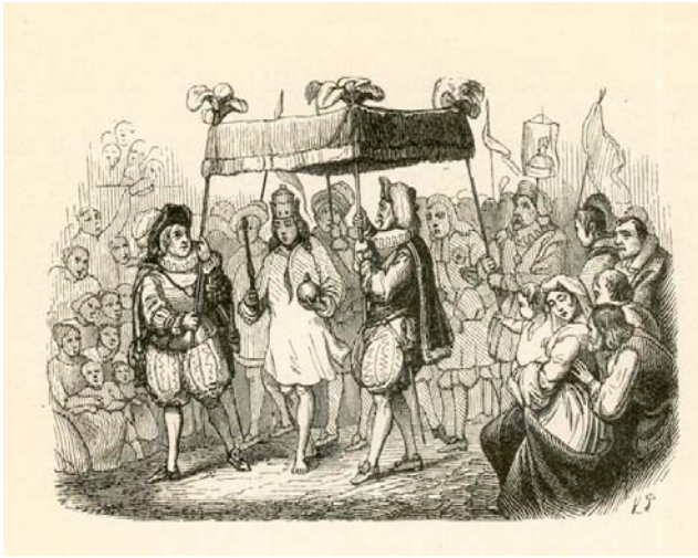
Original illustration by Vilhelm Pedersen

In Hans Christian Andersen's own commentary to the 1862 edition of "Fairytales and Stories" Andersen writes, " The Emperor's New Clothes is of Spanish origin. " Andersen mentions Prince don Juan Manuel as the author to whom he is indebted for the idea.