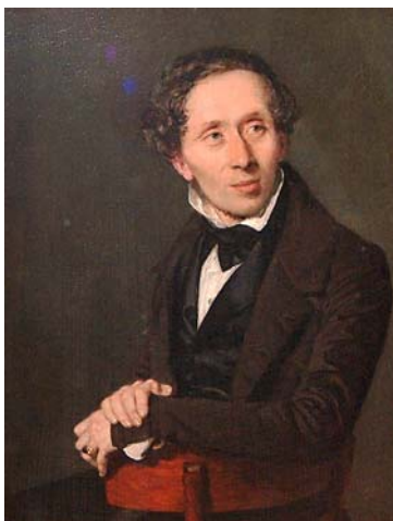
Hans Christian Andersen

When the Tivoli amusement park opened in 1843, it had Chinese décor several places, which inspired Andersen; especially the Chinese Bazaar.