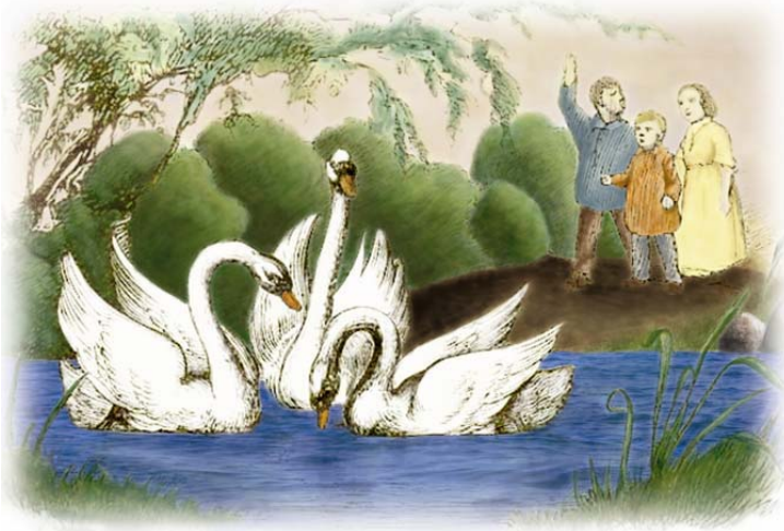
Original illustration by Vilhelm Pedersen