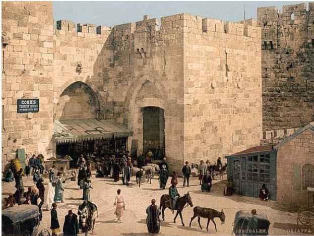
Jaffa Gate - "David's Gate"

Download the complete story in PDF format: Click here .