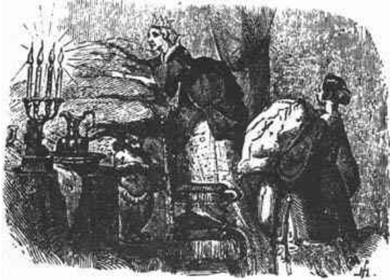
Original illustration by Vilhelm Pedersen